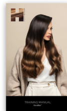
PRT74 HH Training Manual