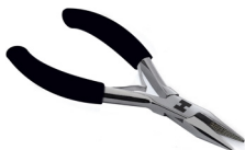
X187 HH Keraflex™ Remove Tool