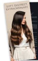
PRT75 HH Keraflex™ Home Care Guide

*Keraflex™ Toolkit items are subject to change based on availability without prior notice.