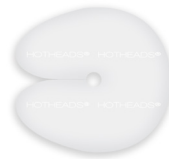
X110 HH Keraflex™ Extension Shield, 10 ct